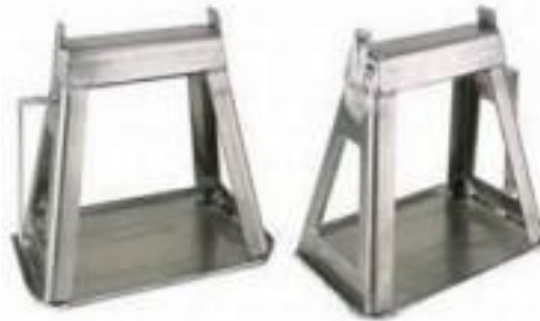
Exhibit 2: Transponder Mounting Location